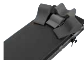
TrenGuard® for secure, steep Trendelenburg positioning.

For more information please contact your local Hillrom representative.