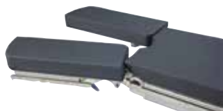
Two-Part Leg Section for midline access.

Hillrom offers an additional accessory package of specialty components that optimize patient positioning capabilities for complex robotic-assisted surgeries.